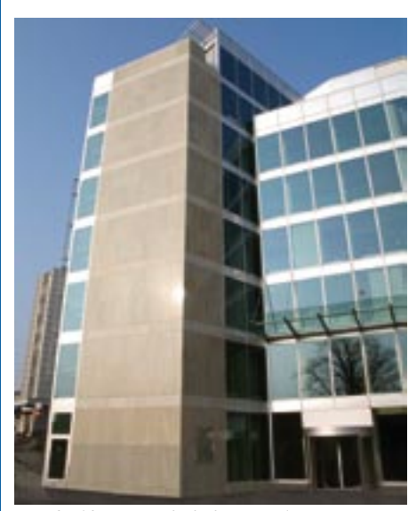
New building into which the Central Secretariat moved in February 2007.

The TMB is responsible for the overall management of the technical work, and also reports to the Council. TMB decides, among other things, on the establishment of technical committees and appoints their Chairs. ISO's day-to-day operations are managed by the Secretary-General, who is appointed on a permanent basis and heads the Central Secretariat (ISO/CS) in Geneva, Switzerland.